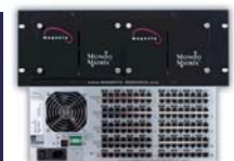
Mondo Matrix Cat5 Switch 16x16—256x256 221R3001