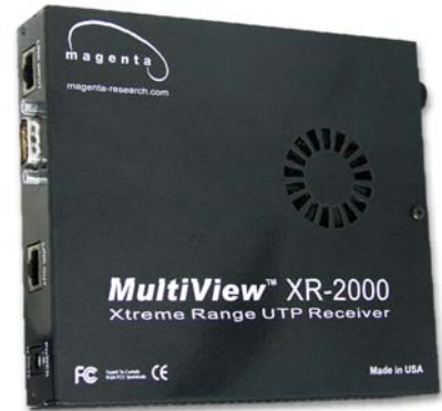
MultiView XR-2000DP-A Receiver 400R3681

Breakthrough MultiView XR-2000 Receiver widens Magenta's performance lead in video resolution-over-distance of UTP cable