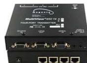
MultiView T4A Transmitter 400R2960