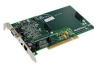
MultiView PCI Transmitter 4003246